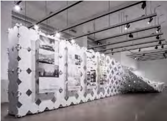
2x8 EVOLVE. A+D Museum 2014