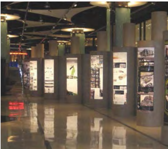
2x8 VERT. Pacific Design Center 2007