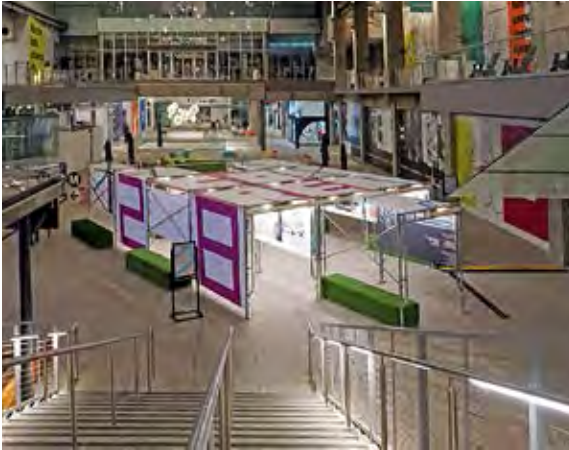
2x8 CORE. The Bloc DTLA 2017